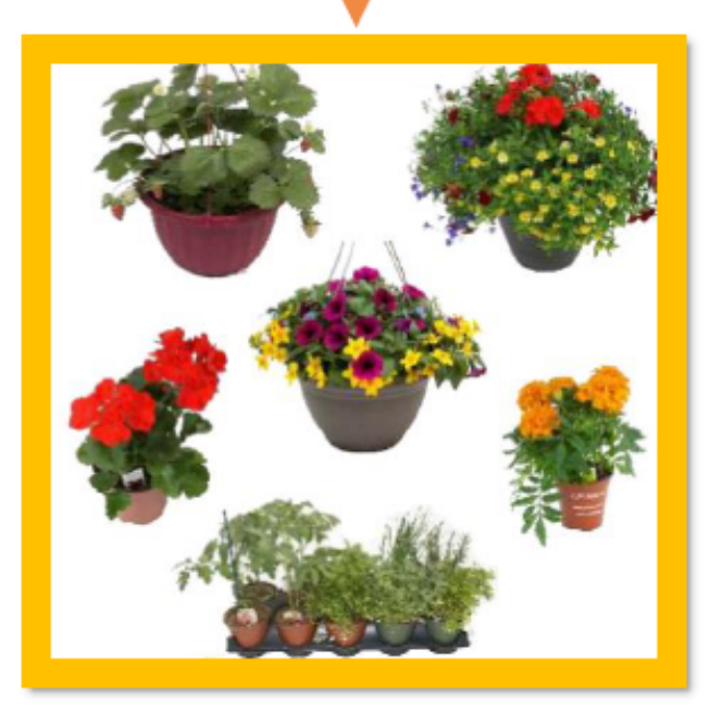
Growing Smiles Illustration of Spring Plants