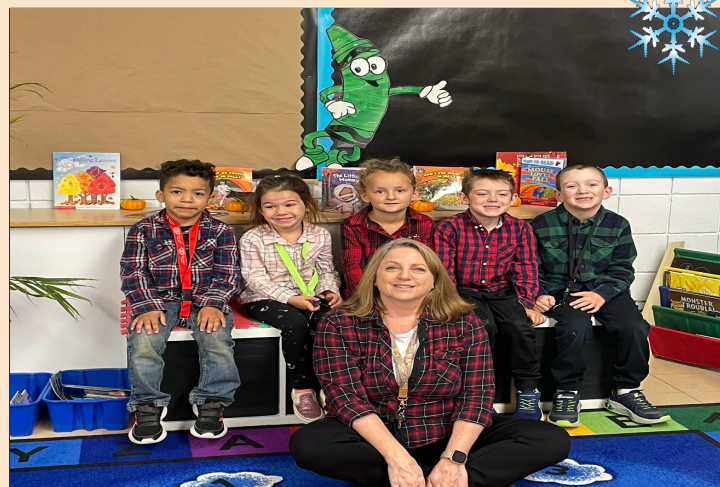
Dress like your Teacher Day