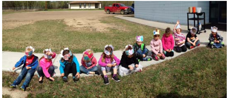
Celebrating Earth Day by planting GIANT pumpkin seeds. Exploring a Bug's Life and sight words.